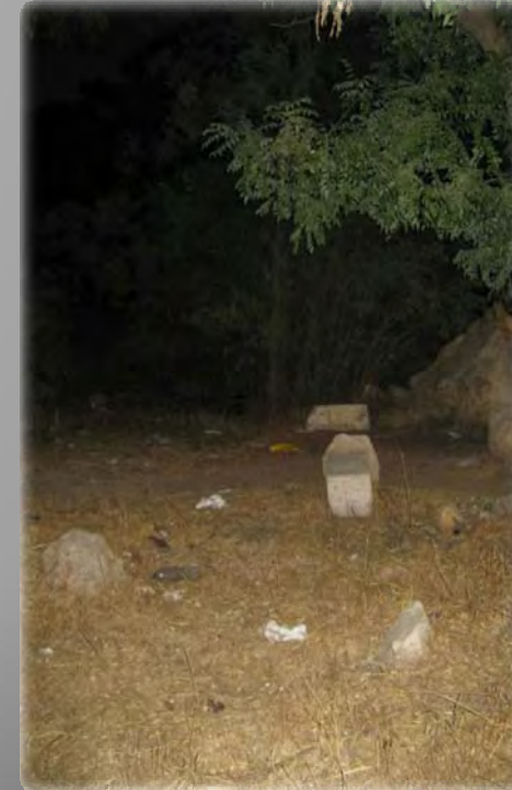
The area around the cemetery is overgrown: dried out weeds and grass. Rubbish is everywhere.

Campaign to Preserve Mamilla Jerusalem Cemetery – February 2010