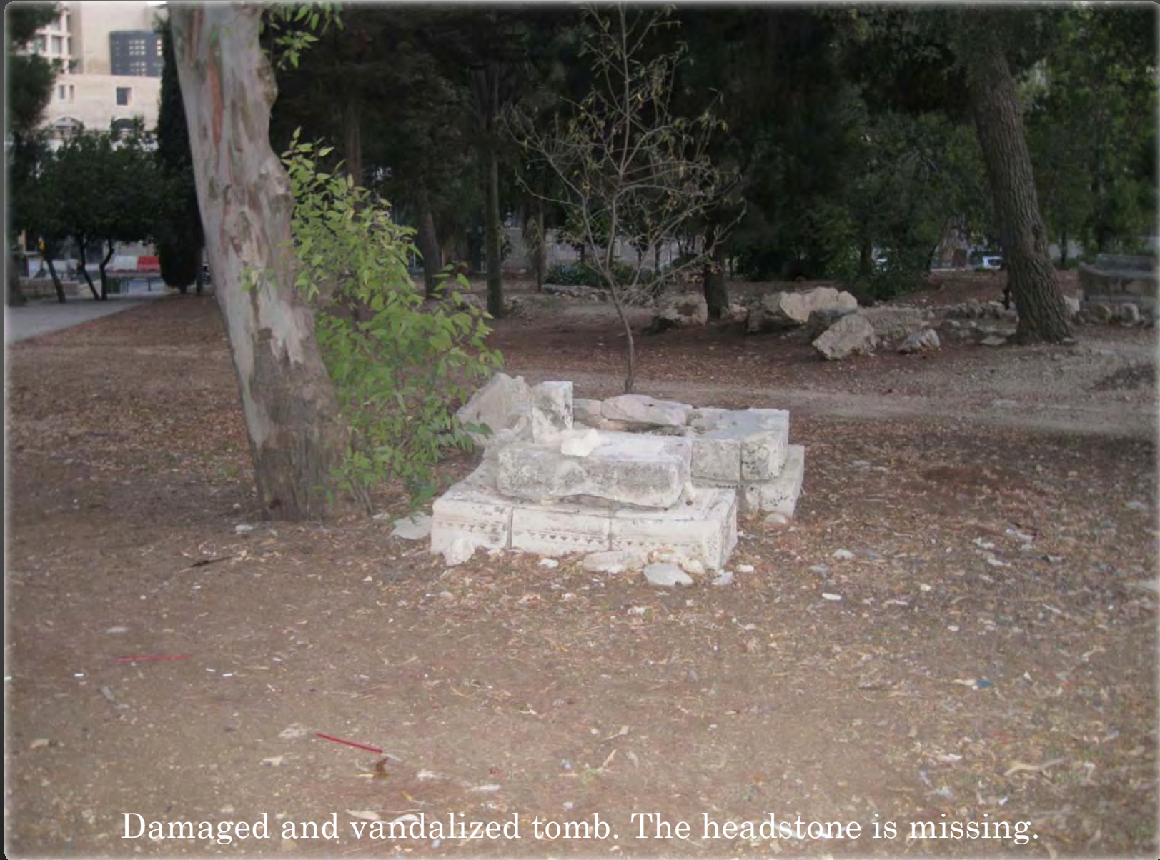
Damaged and vandalized tomb. The headstone is missing.

Campaign to Preserve Mamilla Jerusalem Cemetery – February 2010