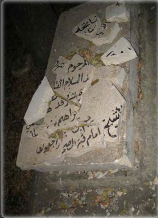
Deliberately broken gravestones.