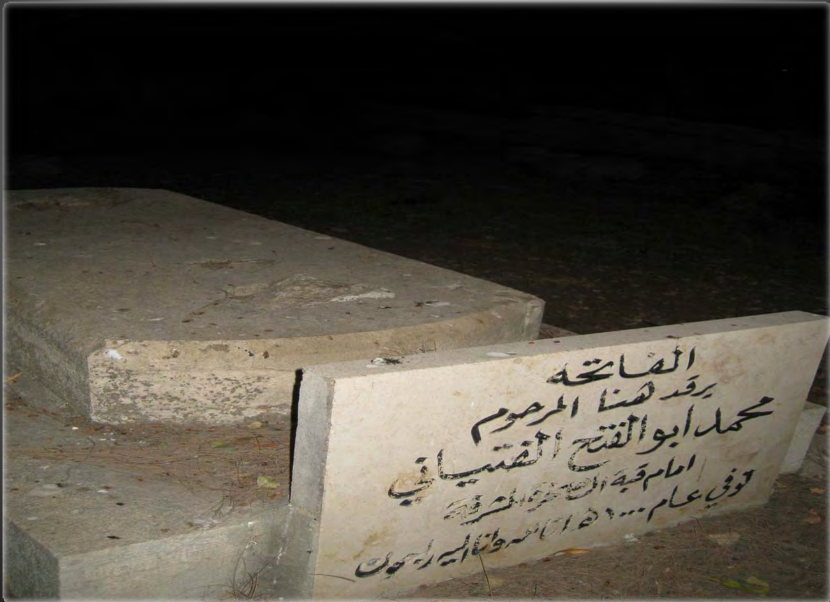
Campaign to Preserve Mamilla Jerusalem Cemetery – February 2010