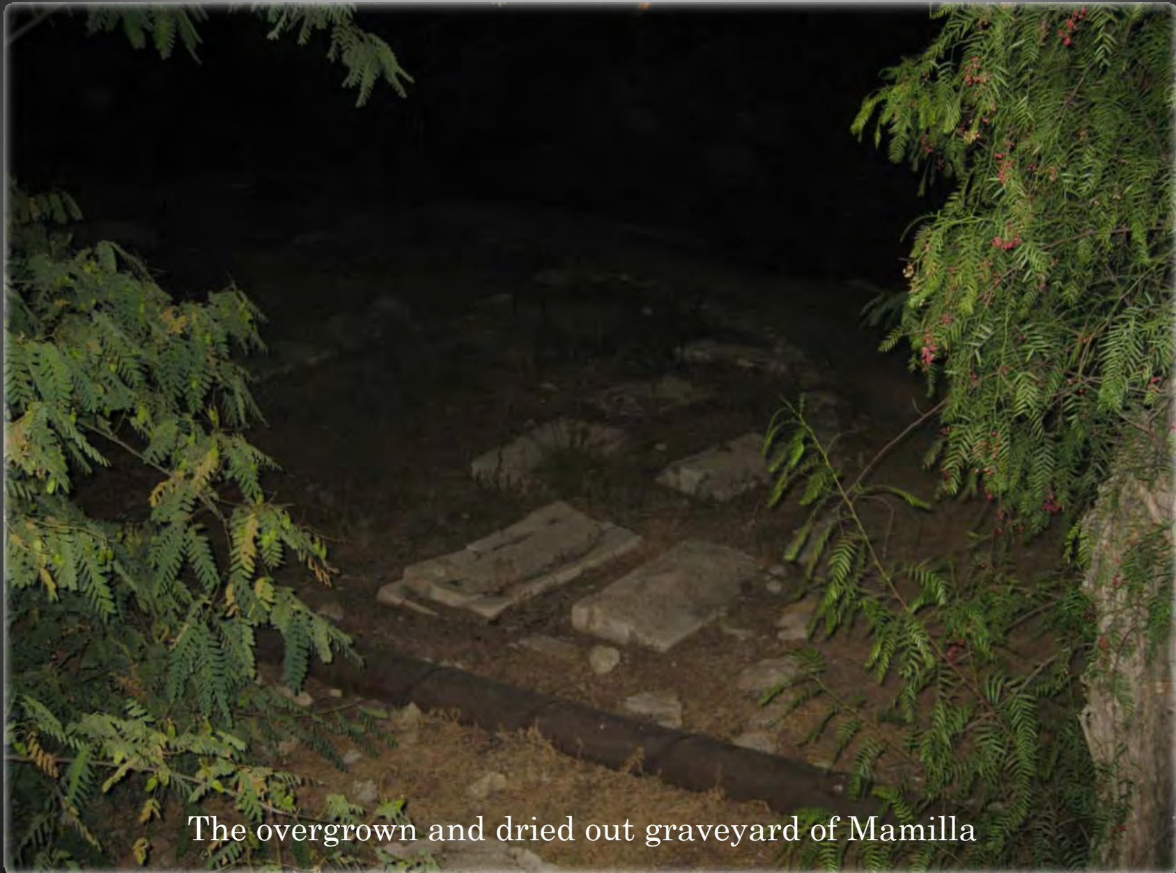
The overgrown and dried out graveyard of Mamilla

Campaign to Preserve Mamilla Jerusalem Cemetery – February 2010