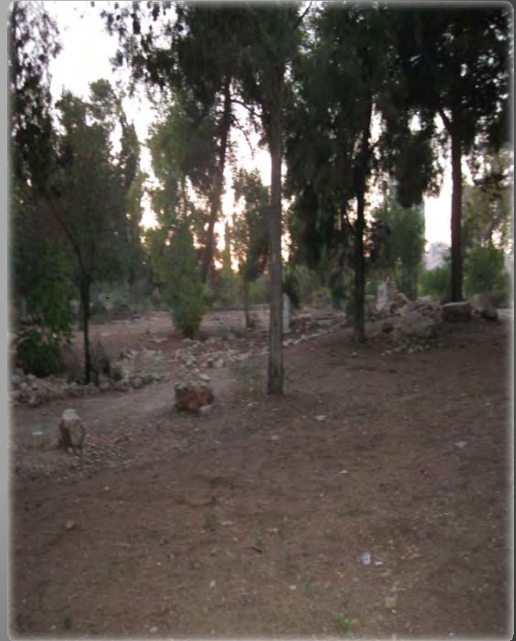
The southern entrance of the Mamilla Cemetery.

Campaign to Preserve Mamilla Jerusalem Cemetery – February 2010