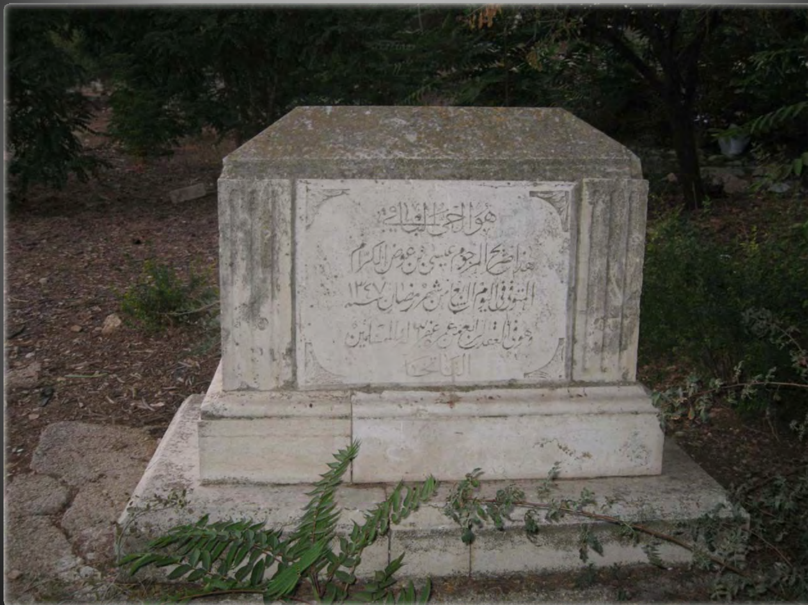
Campaign to Preserve Mamilla Jerusalem Cemetery – February 2010