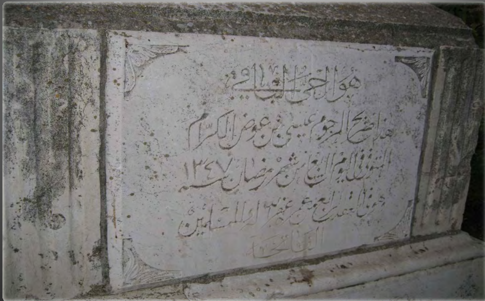
Campaign to Preserve Mamilla Jerusalem Cemetery – February 2010