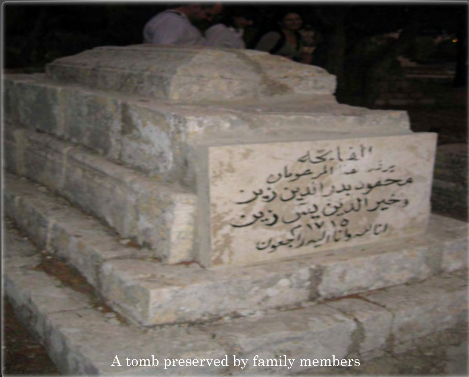
A tomb preserved by family members